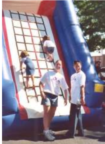
Volunteers from Poudre High School at the inflatable slide in the blazing sun.