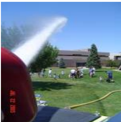
Cooling off, courtesy of Pueblo Fire Dept.

Goodie bags were given to all of the kids with different kid-friendly items such as frisbees, pencils, tea and ice cream cone certificates from McDonalds of Pueblo , Joubert Photography , Celestial Seasonings and SCA Insurance . The Kids Directory provided sweet treats to add to the goodie bags.