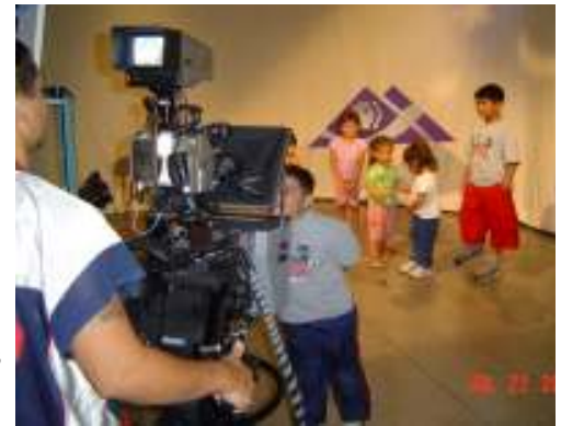
"Look, Mom. I'm on TV!"

With the temperatures rising outside and the station getting busier and busier, the Pueblo Fire Department came to the rescue by showing the kids the fire hose on its truck and demonstrating how the different streams of water put out fires or, in this case, cooled off kids and their parents!