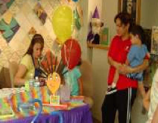
Kids wait eagerly for face painting.

Approximately 250 children, along with their parents, met Clifford the Big Red Dog and Arthur at the 2nd annual Kids Club Fun Fest at the KTSC studios on Friday, July 22. It was a beautiful summer day with temperatures hitting the 105-degree mark!! But everyone stayed cool by eating the ice cream provided by Meadow Gold Dairy and by visiting the sponsor exhibits located in the air-conditioned building of KTSC. Sponsors included Rocky Mountain Eye Center , which provided the children with a quick eye exam, and San Isabel Electric and St. Mary Corwin Hospital