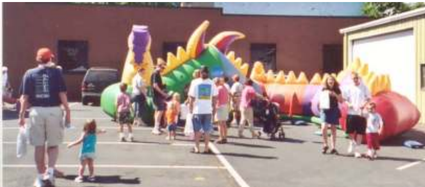
Despite the heat, kids loved the inflatable dragon maze.