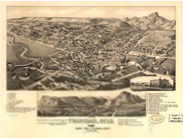
Trinidad, Colo. 1882 county seat of Las Animas County.

http://digital.denverlibrary.org/cdm/singleitem/col/lection/p15330coll22/id/1960/rec/11